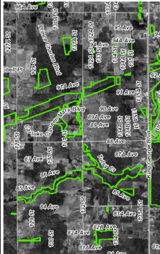
1949 Aerial Map of Area

Names highlighted in yellow have not been able to be cross-referenced