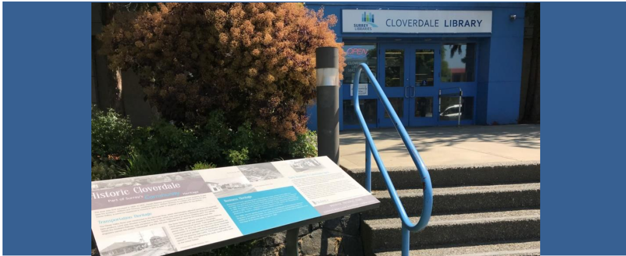
Surrey Interpretive Storyboard, Historic Cloverdale