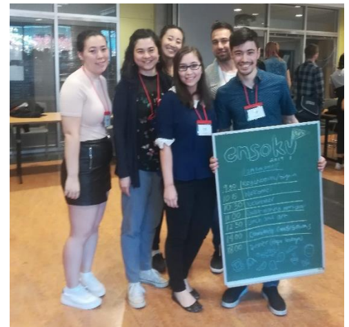
YLC members at Ensoku

Since being appointed as the Chair of the YLC on October 5 th 2018, my priorities have been to encourage more face-to-face opportunities for JCYL to meet and connect with one another, as these interactions create lasting relationships that make our community stronger as a whole. Supporting YL-led initiatives through the Young Leaders Fund (YLF) as well as offering financial support to locally organized youth gatherings, such as Ensoku (“youth gathering”) in Vancouver and Kessoku (“youth retreat”) in Toronto, allows YLs to produce amazing projects and events. Increasing communication is also extremely important between the YLC and the wider JC community in order to showcase and highlight the hard